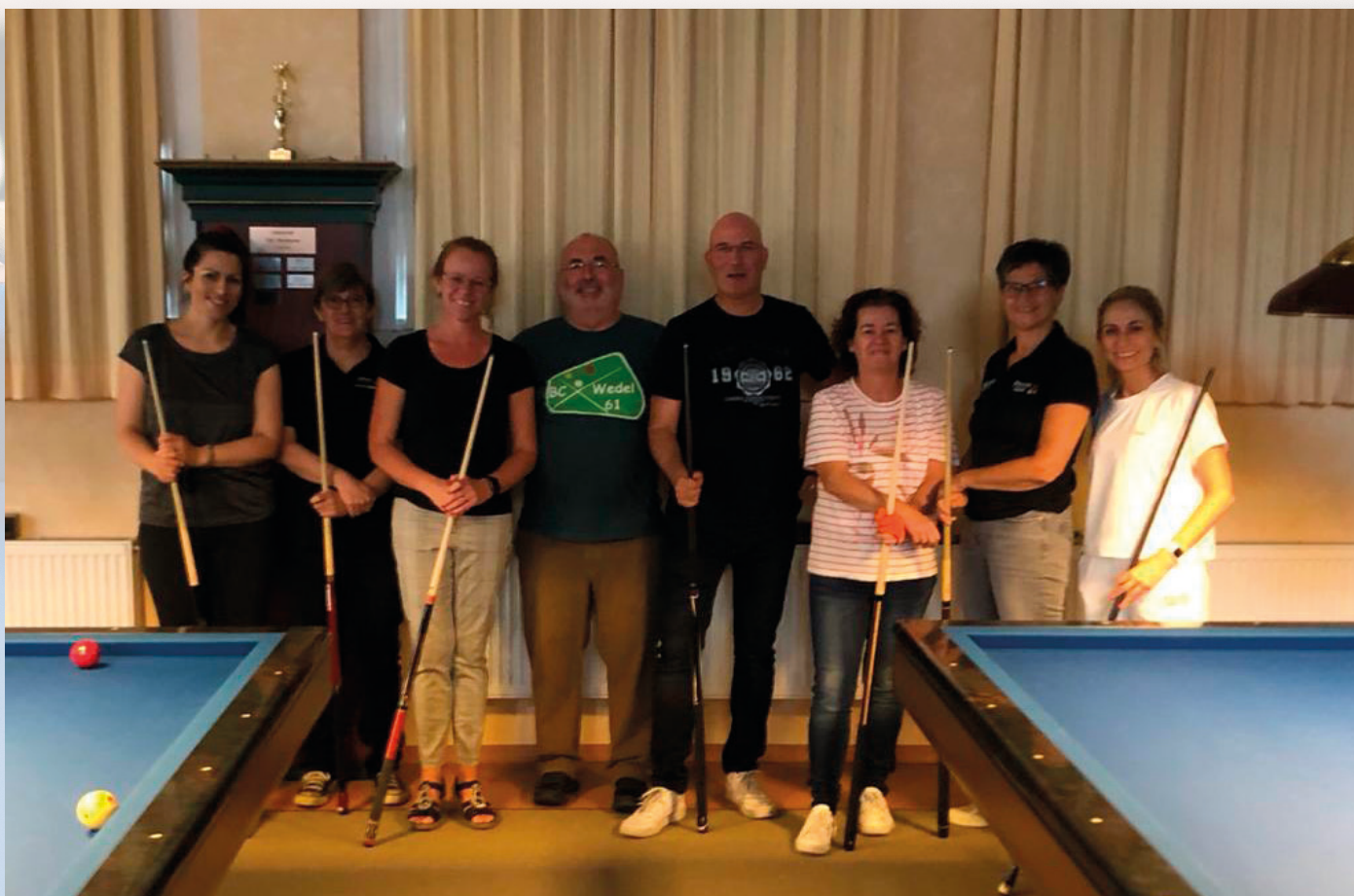
Happy participants in Wedel 2022

To inscribe a player the federation must send the attached registration form to CEB on or before June 30.