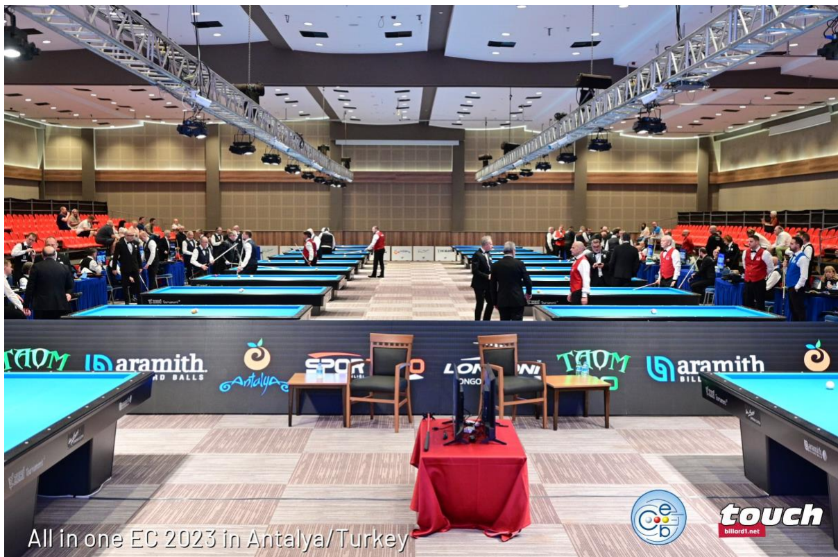
Table and sponsor board set up