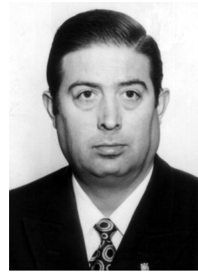
C. Nadal (ES)