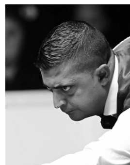
A. Quarta (IT)